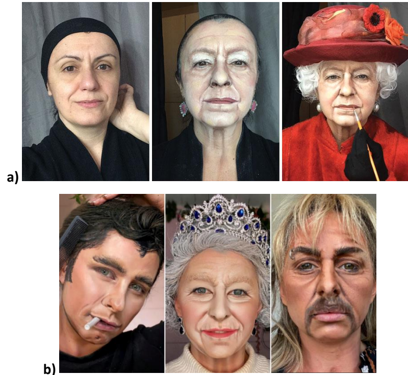
Figure 3 — Examples of make-up using contouring 4

The make-up technique used might any available. An example could be using contouring , such as it can be seen in Figure 3: