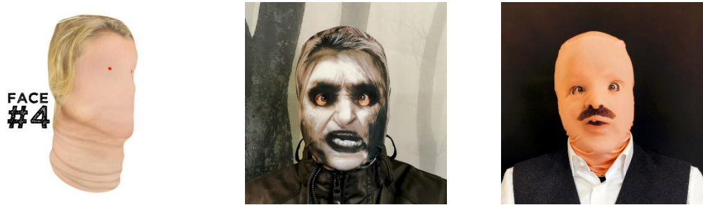
Figure 1 — Examples of second-skin products 2

shall be completed with the use of wigs and any other kind of cosmetic apparel that may lead the ATTACKER to look more similar to the bona-fide user. Figure 1 shows some examples of second-skins.